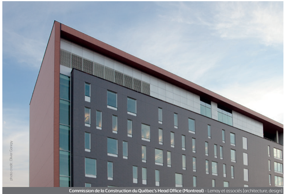
Commission de la Construction du Québec's Head Office (Montreal) - Lemay et associés [architecture, design]